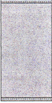
Fold sides and sew.