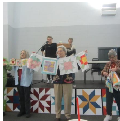
Some members showing their FGV blocks.