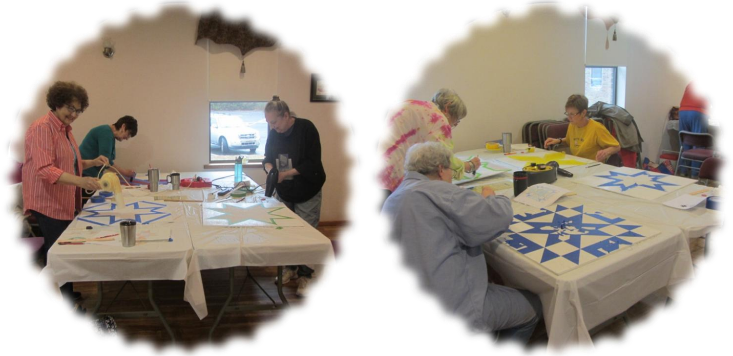
Barn Quilts shown at guild meeting on 2/8/2019