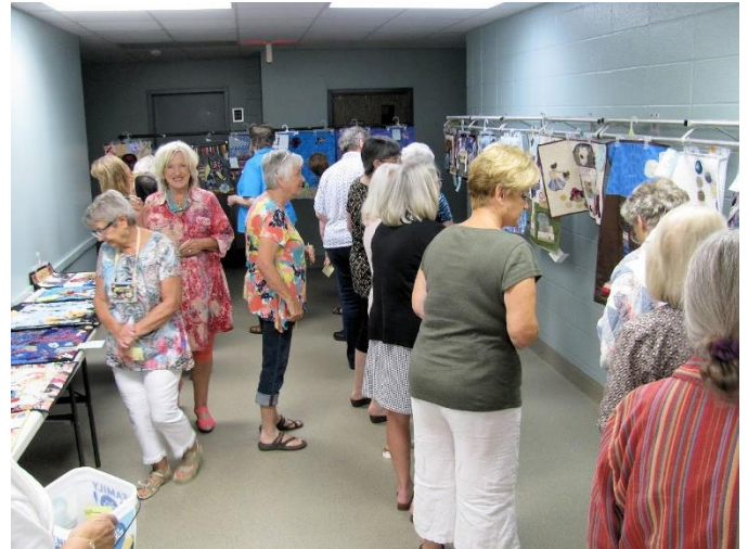
Members checking out Challenge Entries