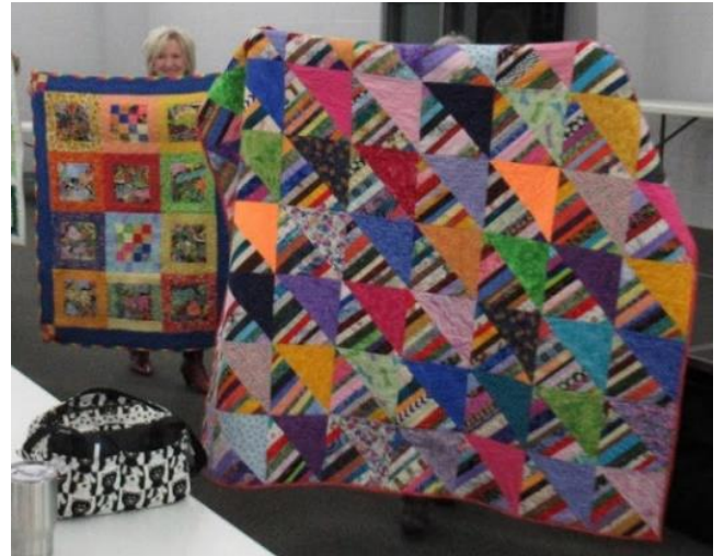
Some of the quilts donated to our Community Quilts program