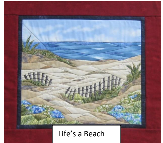
Life's a Beach

" Picture Piecing " is a unique technique developed by Cynthia achieve detailed quilt imagery. This is not Paper Piecing or foundation piecing in the traditional England to sense. This technique is much more! While you do use paper and Straight seams, Picture Piecing has several differences, allowing quilters to achieve detailed imagery more efficiently, with less frustration and fabric waste. Best of all there is no paper to pick out, no curved or inset seams, patterns are reusable and you can CHEAT!