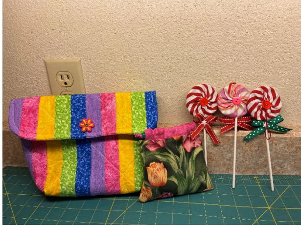
Picture #2 Sweet Treat Bag - Shabby Fabrics, Cutie Pie Pouch - Lazy Girl Designs, Lollipop Christmas ornaments - Sharon Crozier.