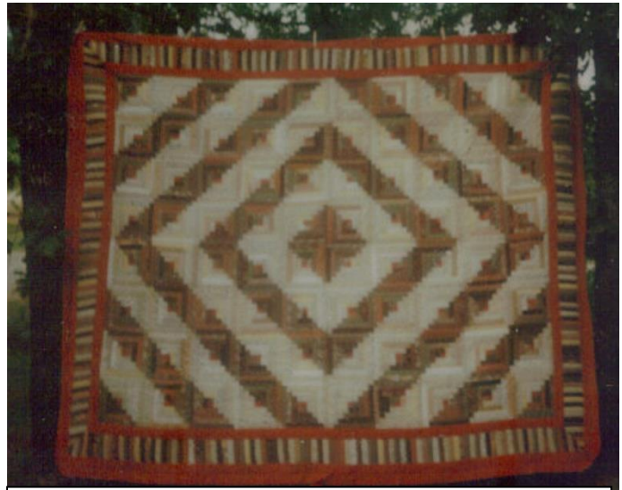
Guild's first fundraising quilt – 1984.